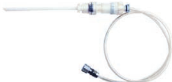
Sampling probe (with water trap function)