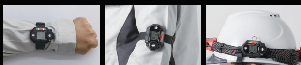
Attached to wrist (wristwatch type) *Attached to watch band